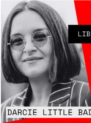
DARCIE LITTLE BADGER